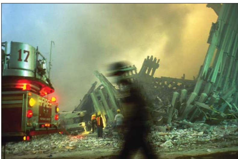
Clearing the smoke. Rapid sampling of rescuers alleviated some health concerns.

of 210 chemicals in nine people. In April, the World Wildlife Federation tested for 101 compounds in 39 members of the European Parliament. The impetus is clear: Such studies can generate headlines and political